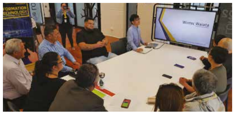
'The Whānau' present their waiata app prototype to the Wintec Māori Achievement Unit.

While the theatre will always be there, a career in arboriculture is now his calling.