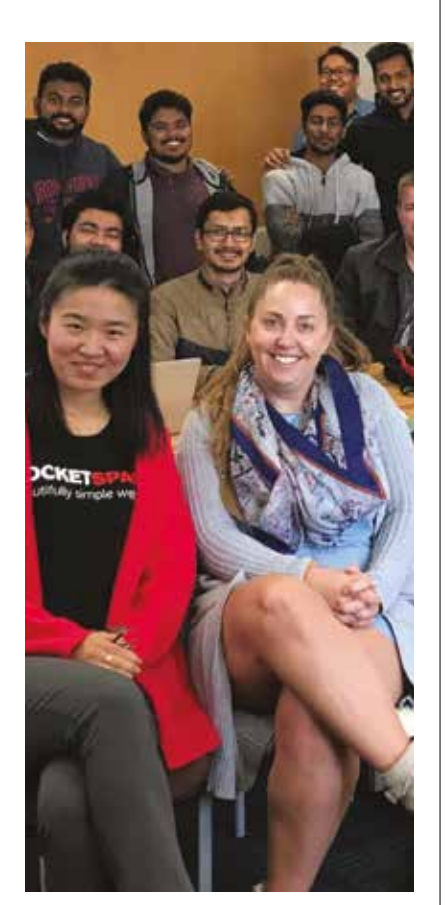
Wintec students studying supply chain and logistics have built 80 free websites for local businesses.

"Our business partners get a website that meets current industry best practice, and our students benefit from the experience of building that site, understanding customer requirements and focusing on what works for them and their customer base."