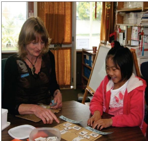
A graduate of the programme working in a Hamilton Primary School.