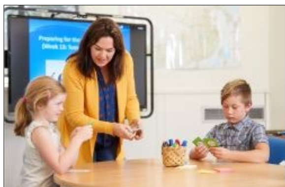
A teacher on the programme working with young learners

"It is well worthwhile doing if you are teaching ESOL students. It puts you in the place of the learners, gives you skills and strategies to employ and provides you with the material and opportunities to research and improve your practice."